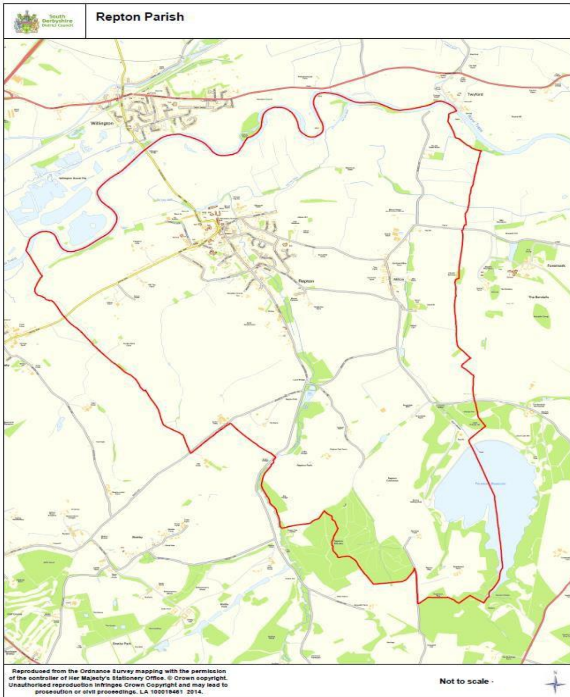
Figure 1 Extent of Neighbourhood Area for Repton Parish Plan