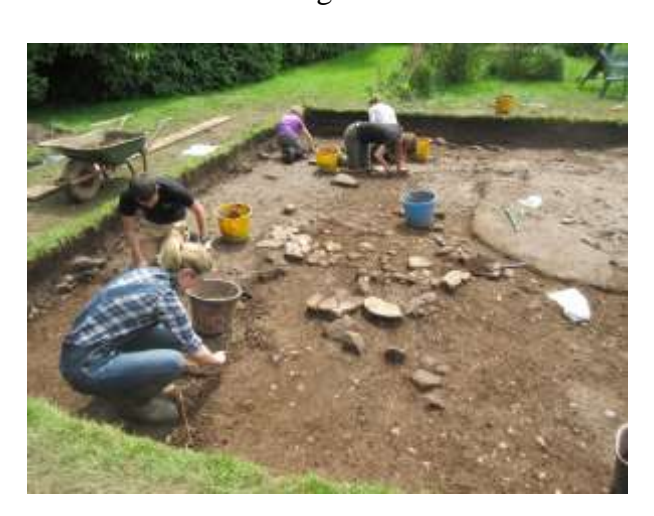
A wall (?)