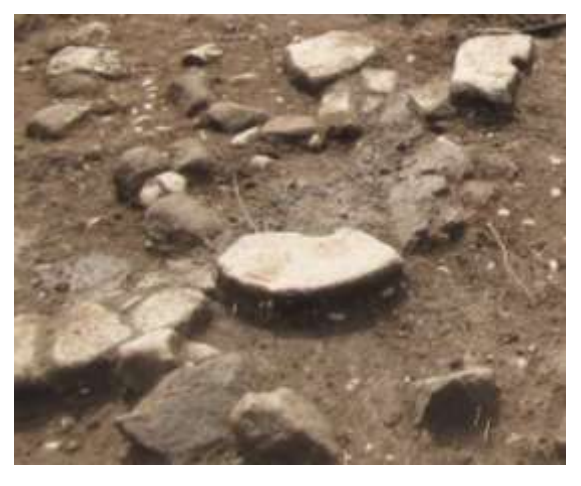
Bits of quern Stones