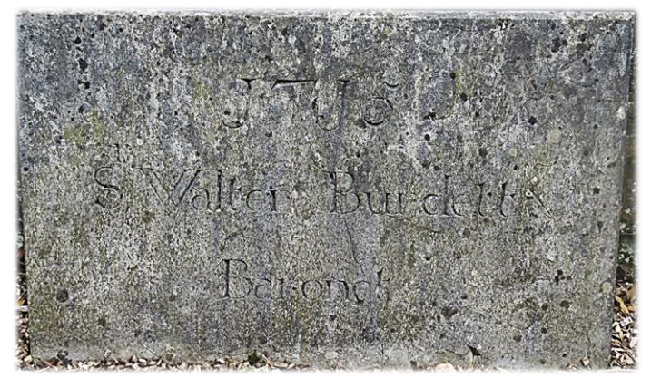
The stone as we found it