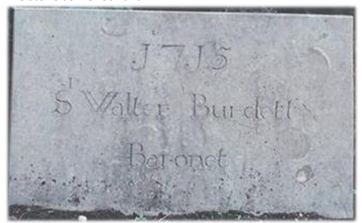
The stone as they found it – from their website.

We mentioned this stone in our last news latter and since then have contacted The Landmark Trust about it and suggested that it ought to be at Knowle Hill – as quirky an item as Knowle itself. The Landmark Trust bought and restored what could be saved of Knowle Hill and offer it for holiday lets.